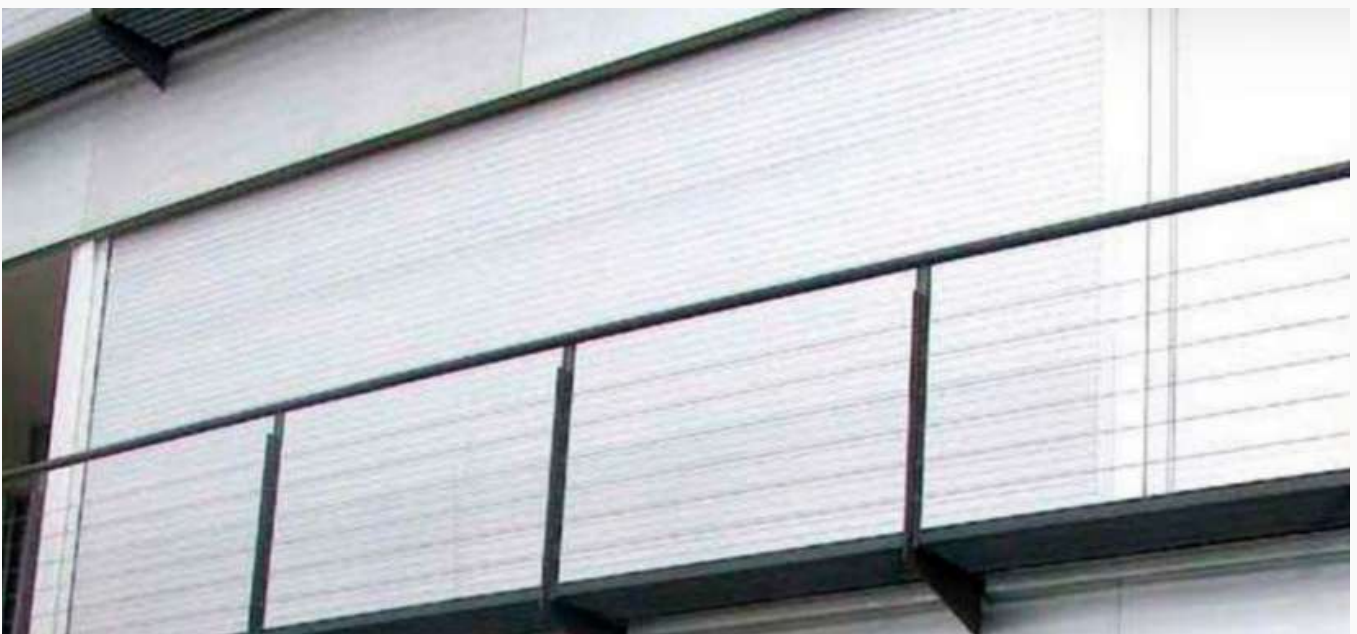
Modelo Custodia Basic color 9006